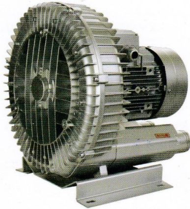
Single stage ring blower